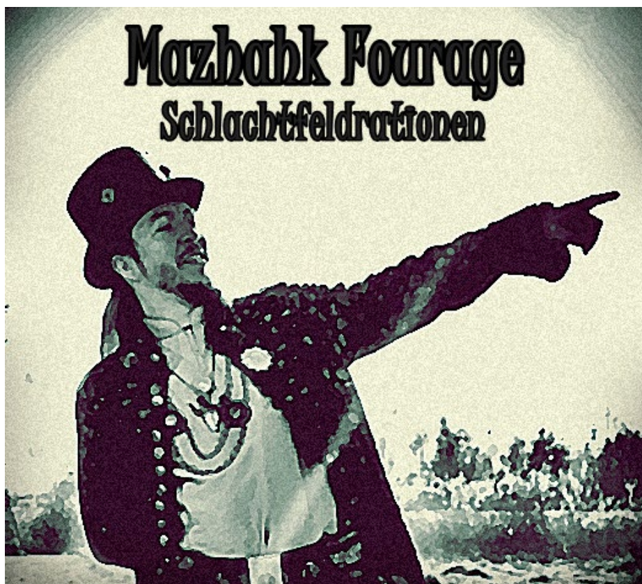
Raül Mazhahk ân Oshead, Manca'Quar of the Kingdom of Roses, Governor of Gutenbucht and founder of the trading house Mazhahk

But it was just a travelling trader and his two sons, a car and two old